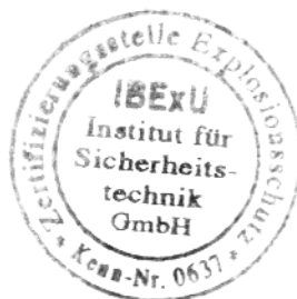
- Seal - (ID no. 0637)