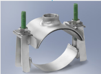
Tapping saddle for diameters between 100 and 400 mm